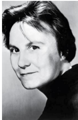
Harper Lee

If Nelle Harper Lee ever wanted proof that fame has its drawbacks, she didn't have to look farther than her childhood neighbor, Truman Capote. After her enormously successful first novel, she has lived a life as private as Capote's was public.