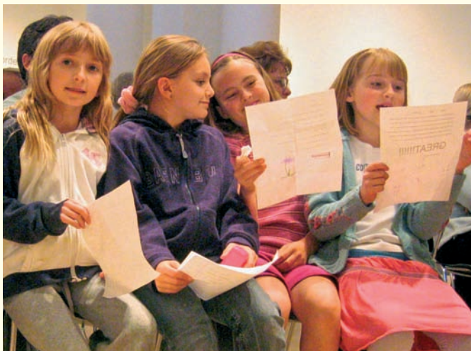
Excited fourth-graders wait to share their work at a reading at the Missoula Art Museum, the culmination of a Missoula Writing Collaborative writer residency.

MWC: We began in 1994 with support from the Charles Engelhard Foundation. Since then we have grown—mainly through word of mouth from teachers and principals—from five school residencies in Missoula, Montana, to our current fifteen, located in Missoula and surrounding rural areas, including the Flathead Reservation of the Confederated Salish and Kootenai Tribes. This year we were invited to mentor efforts by the Pacific Writers' Connection to reestablish a writers-in-the-schools program in Honolulu, and we've begun initial planning for our own pilot residency in Alaska (dependent, as always, on funding).