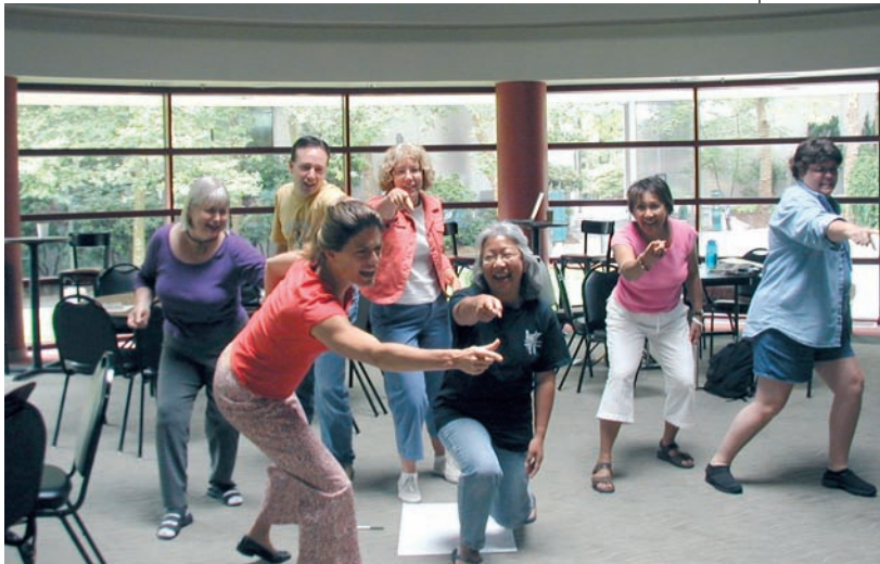
Bringing Theatre into the Classroom participants work on integrating tableaux into their lesson plans.

Overall, teachers have noticed that, after incorporating concepts learned during the BTiC sessions into their curricula, their students not only have a greater grasp of theater skills and knowledge, but the students' participation, enthusiasm, self-esteem, and ability to understand text have increased. In short, they're learning and having fun.