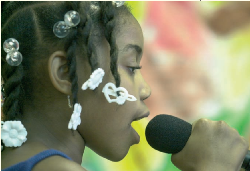
A young vocals student performs at the Alabama Blues Project after-school Spring Camp Open House, where children perform in front of a public audience of their friends, family, and other members of the community.

also a licensed, certified social worker, who deals specifically with troubled youth. We take about 20–30 minutes each week, and he'll introduce and talk about a different topic with the kids, issues like anger management, resolving disagreements, and being positive about other people's achievements. It's all perfect because the kids then move toward playing together as a group. We try to encourage all our instructors and youth workers to really pay attention in the life skills formal presentation because there are always a million opportunities to bring those lessons out in practice.”