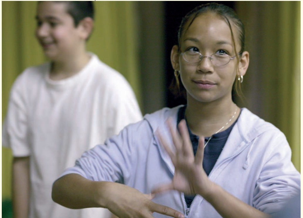
Seventh-grade students participate in a Hubbard Street Dance Chicago education residency in Chicago public schools.

residency may suddenly recognize that a difficult student can communicate and lead effectively, so will that student realize that he has something to say and an effective way to communicate his ideas. . . . Perhaps, more importantly for me, his teacher will see something