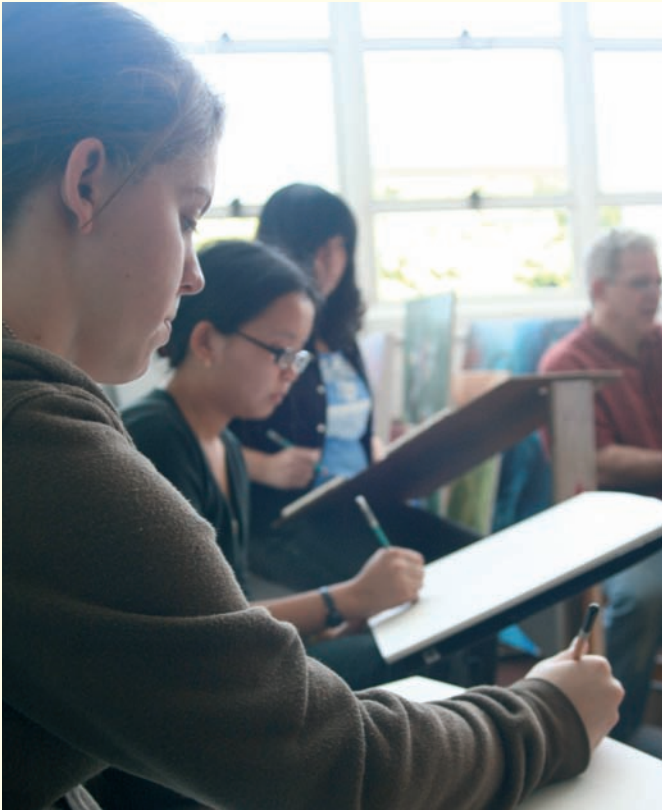
Ryman Arts students benefit from the opportunity to work with peers who are as dedicated as they are.

On any Saturday from September to May, you may find a focused group of teenagers rendering a still life in an University of Southern California art studio or sketching taxidermied animals at the nearby Natural History Museum. These students are just a few of the approximately one thousand students who have taken part in Ryman Arts's signature Saturday studio classes for high school students since 1990.