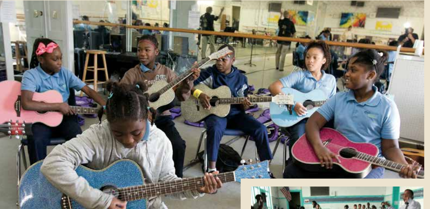
ABOVE | The NAMM Foundation spent a day at the Batiste Cultural Arts Academy providing music lessons and introducing students to different instruments.

RIGHT | The Bastite Cultural Arts Academy Marching Band practicing for its performance during Mardi Gras.