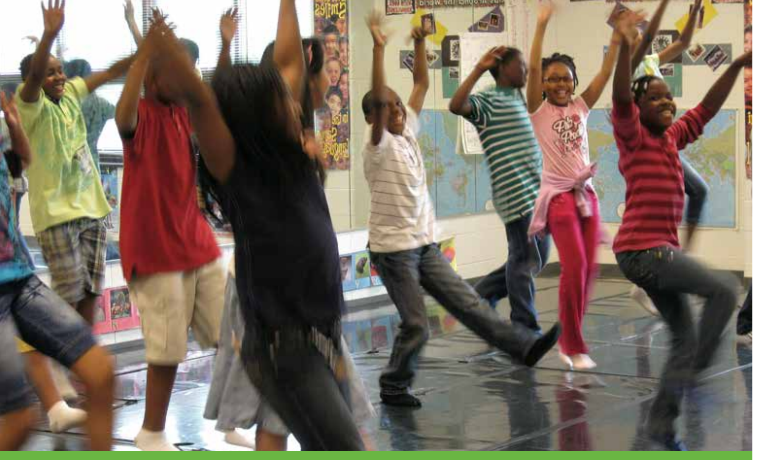
ABOVE | At A+ schools, teachers create an arts-rich learning environment, such as the dance class shown. OPPOSITE | Gatesville Elementary teachers build their team through arts-enriched, collaborative A+ professional development experiences.

statewide North Carolina school performance levels. Over the next two years, the A+ Schools Program will serve as many as 1,200 Gates County students and 115 faculty members. Once the three remaining schools in the county complete their A+ training, the county's public school system will be the first district in North Carolina to include all of its schools in the A+ School network.