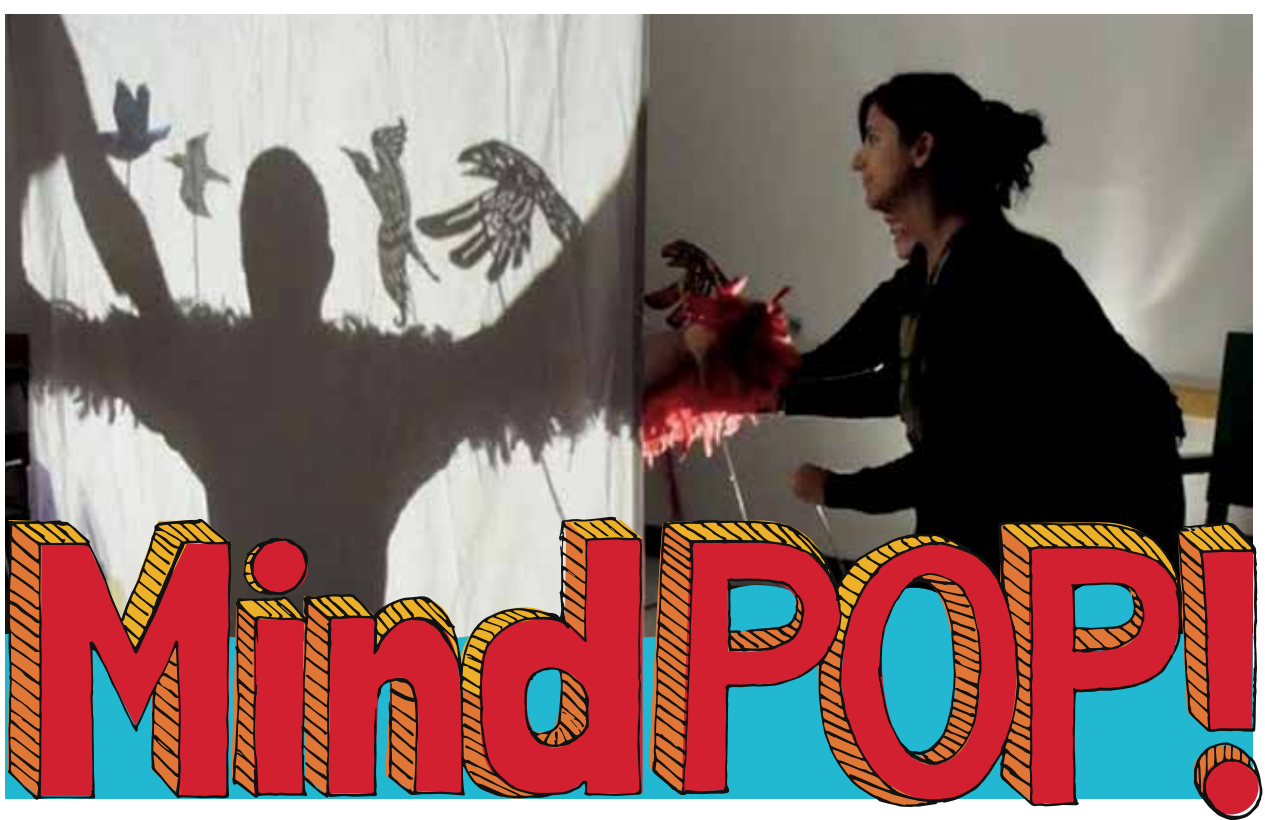
Austin Independent School District's "Aha!" Moment