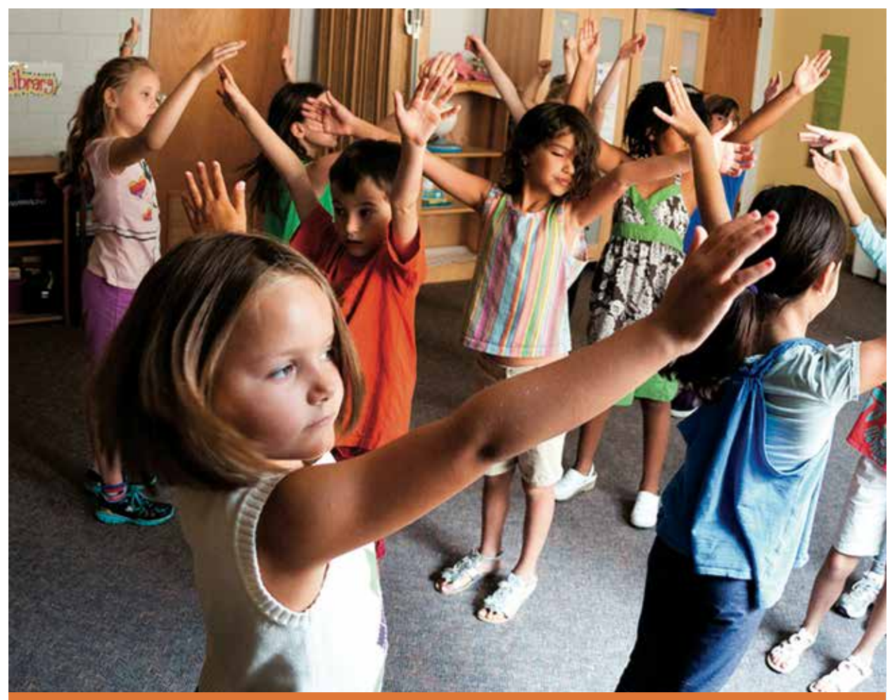
ABOVE | Creative Action, another MindPOP partner, works with Austin students. OPPOSITE | VSA Texas leads students in a drum circle.

After the working group teased out the challenges they needed to address, they recognized MindPOP as a nonprofit hub for stakeholder collaboration and to oversee the strategic planning process. Goodman described MindPOP—named for the moment in learning when everything "clicks"—as an "avenue for the district, city, community artists, philanthropists, and higher education to join resources and knowledge to create a powerful team of stakeholders in order to move student achievement in Austin ISD."