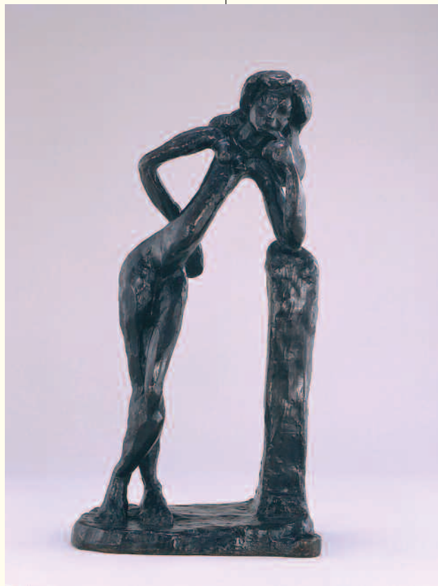
Henri Matisse's sculpture The Serpentine , 1909, was featured in the Dallas Museum of Art's exhibition Matisse: Painter as Sculptor .

MacDonald credits the NEA with helping to make the show a success. "The scope and ambition of this project, in terms of archival, technical, and interpretive components, all of that would have been difficult without that kind of support early in the process. It was important to have the imprimatur of the NEA. It carries a weight and showed the intellectual seriousness of what we wanted to do."