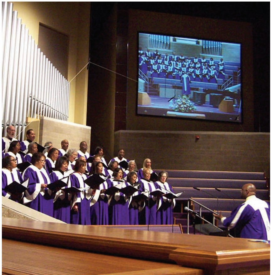
The Plymouth Congregational Renaissance Choir, which won first place as Church/Community Group during Brazeal Dennard Chorale’s spiritual festival in 2007.

The Arts Endowment will award a second year of choral music grants in FY 2007. Those organizations that received 2006 grants also were invited to apply for additional NEA funding in order to broaden the visibility and awareness of these significant American composers of choral works. “We were pleased to provide the additional support to those organizations . . . who wanted to take advantage of regional radio broadcast and recordings. I would say most of them have accepted that invitation and are taking steps to see that we have