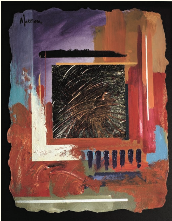
Daybreak by Joe Maktima, a member of the Hopi/Laguna Pueblo tribe, is one of the artworks featured in Artrain’s traveling exhibition Native Views: Influences of Modern Culture .