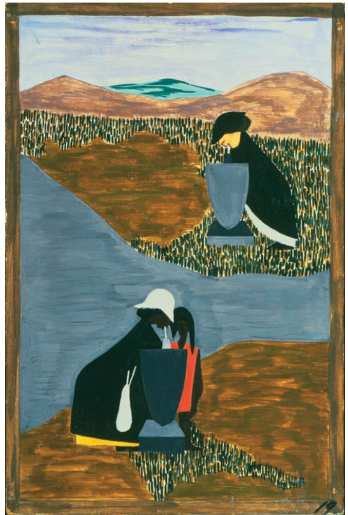
Jacob Lawrence, The Migration Series, "Panel 19—There had always been discrimination."

learn from the docents and from the educators each museum works with. At the Phillips we have a program called the mentor-teacher program, a best-practices program to study how teachers use works of art in their curriculum. So we're taking this model and using it in each of these venues.