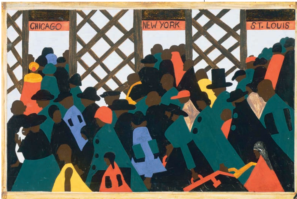
Jacob Lawrence, The Migration Series, "Panel 1—During World War I, there was a great migration North by Southern African Americans."

I also want to point out how we have benefited from this grant. We have really, as an institution, made a commitment to studying The Migration Series and to learning as much as we can about Jacob Lawrence.