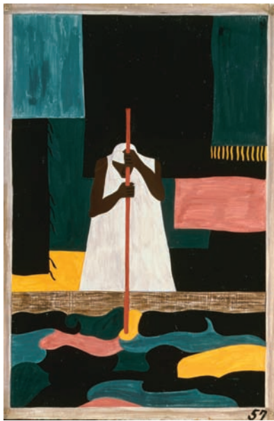
Jacob Lawrence, The Migration Series , "Panel 57—The female workers were the last to arrive North."

PC: One of the things that we developed with the exhibition was a brochure that features excerpts of interviews with the artist, which have never been published before. What we really wanted to do with this tour is let the artist's voice come out, more than it may have in the past.