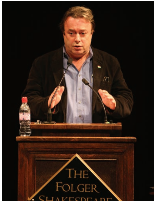
Reflecting on the evening's theme, " All I Have is a Voice," writer and critic Christopher Hitchens noted, "The voice is often enough."