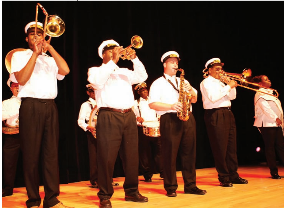
The Treme Brass Band brings a little of New Orleans to the Washington, DC audience during the 2006 NEA National Heritage Fellows concert.

bunch of old musicians played a lot of jazz funerals—when someone in a club died they always wanted a jazz funeral. On the weekends they might play for a parade. Social and pleasure clubs have annual parades every year and his band would perform. I was very inspired by that.