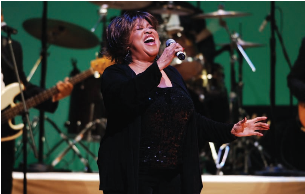
Mavis Staples shows her singing prowess during the 2006 NEA National Heritage Fellows concert.

in my hand. And when I'd get home I'd ask, "Mama, why are these people crying? Why are they putting this money in my hand?" "Mavis," she said, "You make them feel happy. They're crying happy tears and they want to give you something." I would get so much money. My mother had to sew little pockets in my little dresses because I'd put the money on the piano or somewhere and then forget it.