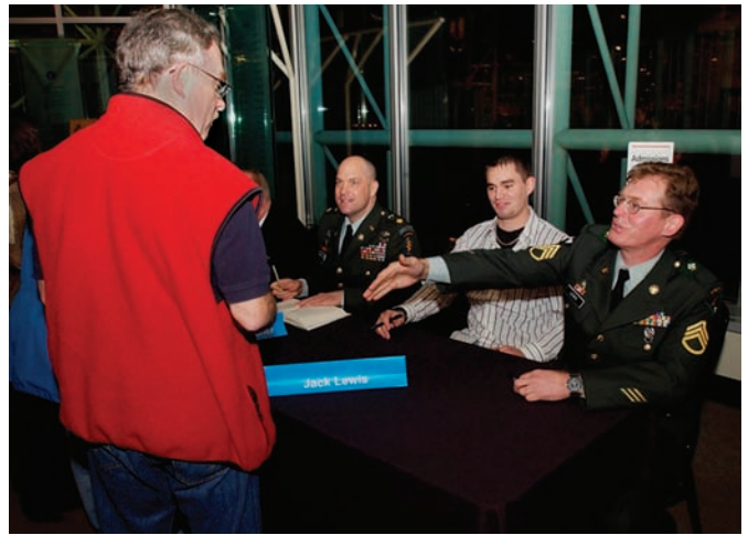
The Museum of Flight in Seattle, Washington, hosted a discussion and signing of the book Operation Homecoming on December 7, 2006.

The audio book of the anthology was one of six books to receive Publishers Weekly ’s 2006 “Listen Up Award” in the full-cast recording category. The annual award is given by the magazine’s audio editors to