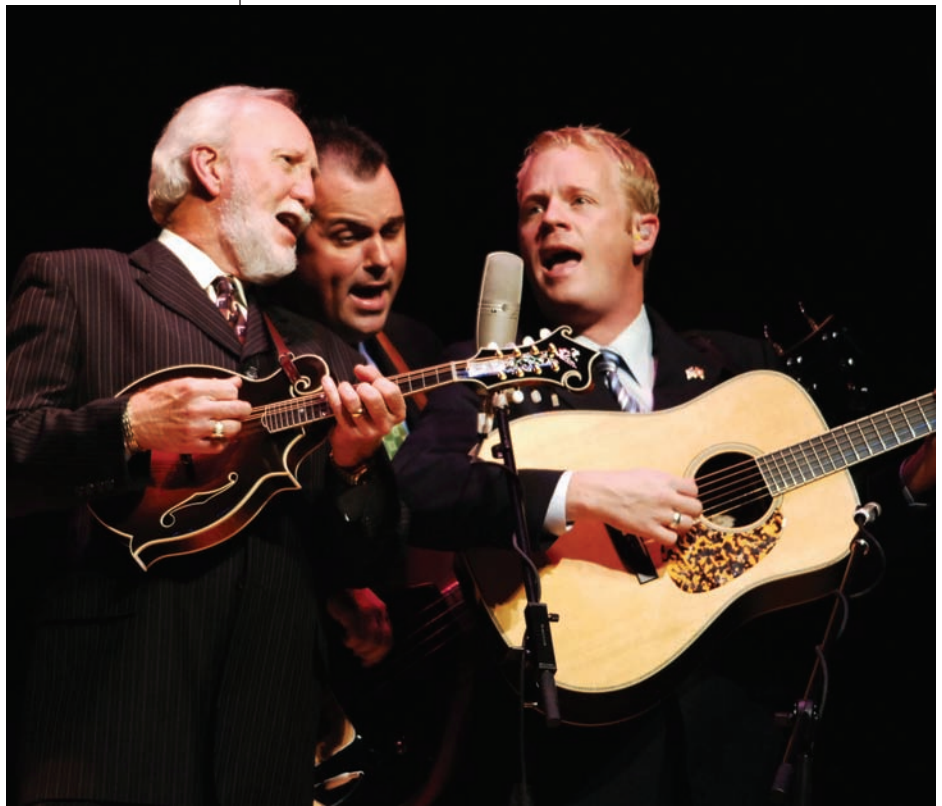
Doyle Lawson (left) and his band harmonize during the 2006 NEA National Heritage Fellows concert.

LAWSON: I don't think there's any one for-sure answer. Sometimes some things work out and sometimes they don't. The one thing I can say is that if you truly believe that your mission in life is to play this music, then stay the course. You'll have to endure the hardships along with the good times, and there will be hard times.