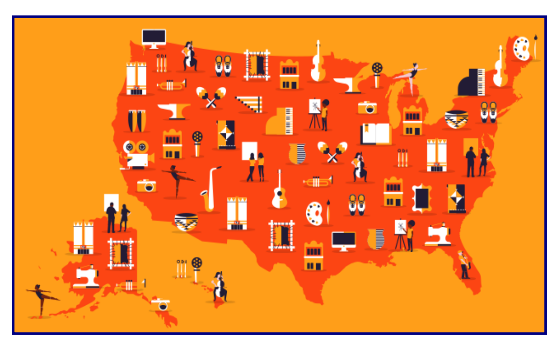
Supporting the Arts Across the Nation