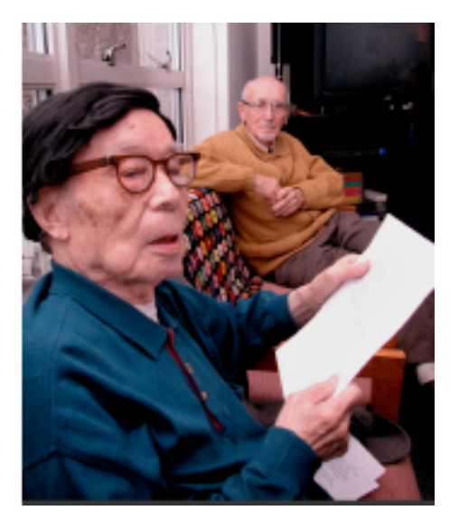
Oldest participant in the study—turned 101 during 2005—reading the poem he wrote to the Brooklyn site poetry group. These groups provide strong camaraderie.