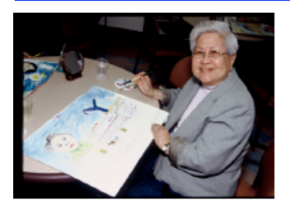
Participants in the art groups of the San Francisco site, demonstrating their accomplishment of mastery and control, and sense of satisfaction in the process.