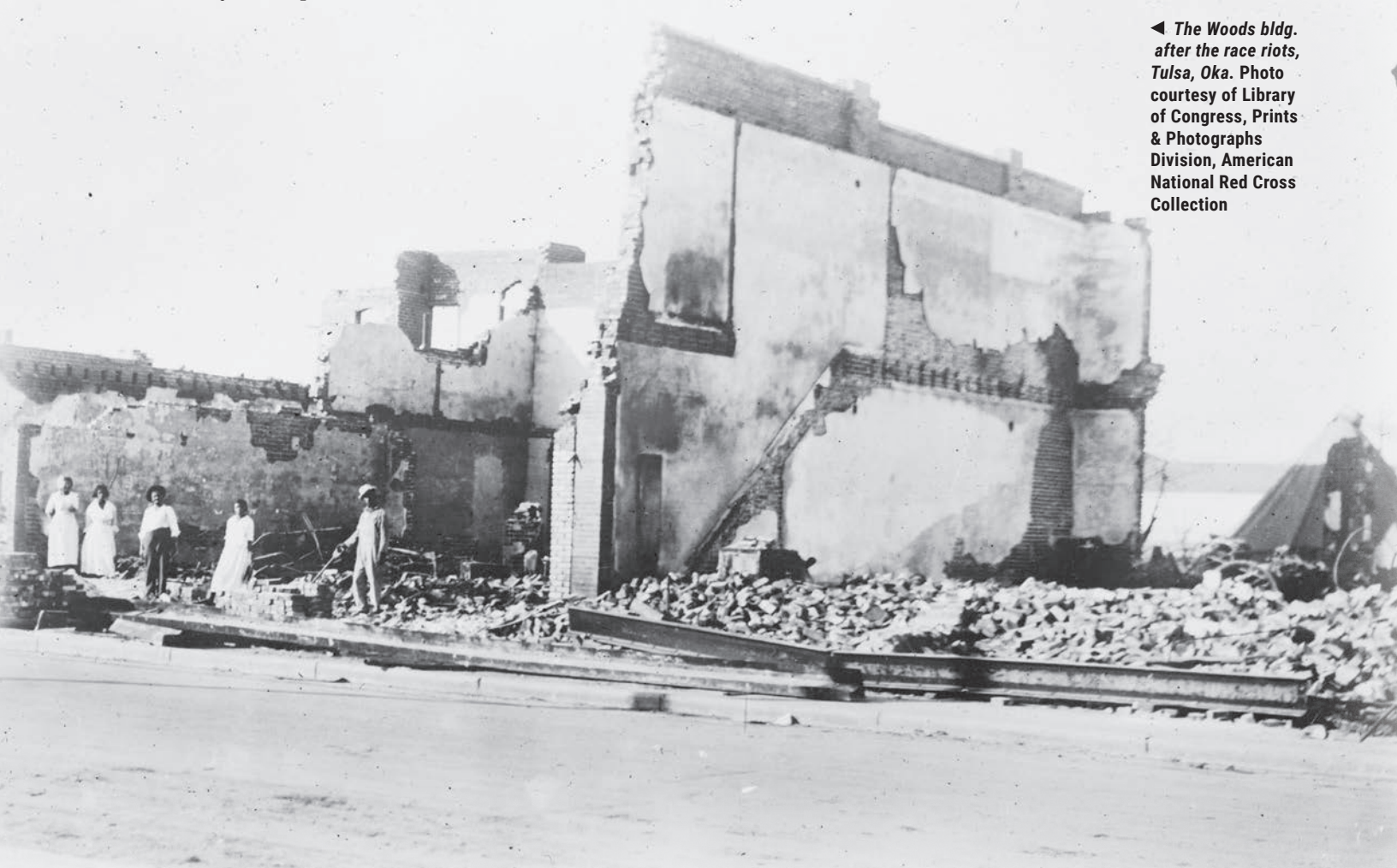
◀ The Woods bldg. after the race riots, Tulsa, Okla.