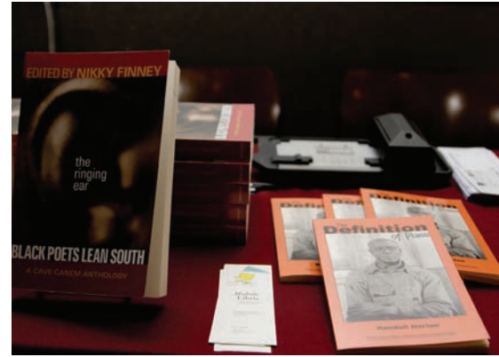
▲ Some books by Cave Canem fellows.