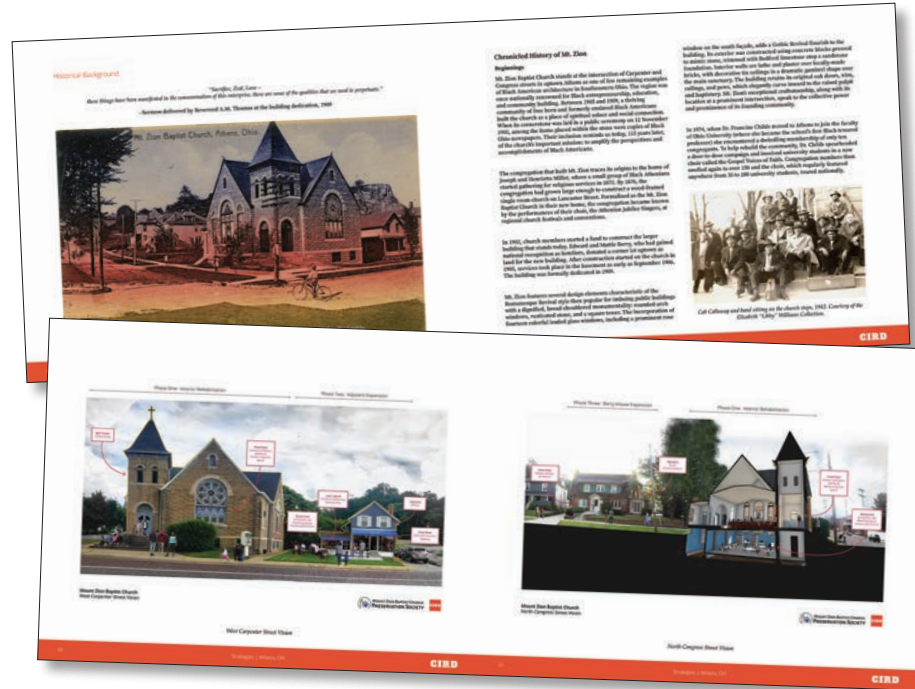
▲ Excerpt pages from the CIR Design Resource Booklet, showcasing Mount Zion Baptist Church's history and the planned rehabilitation and expansion of the buildings.