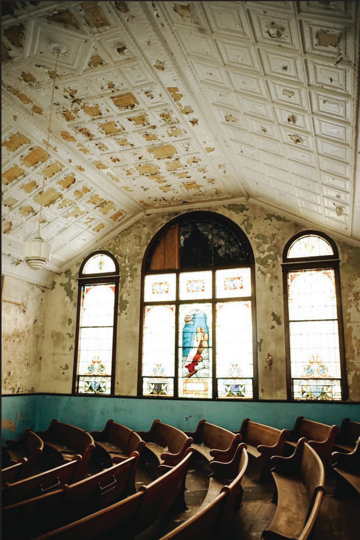
The interior of the Mt. Zion Baptist Church in Athens, Ohio, to be renovated into a community center for the area's Black community through the Art Endowment's Citizens' Institute on Rural Design initiative.