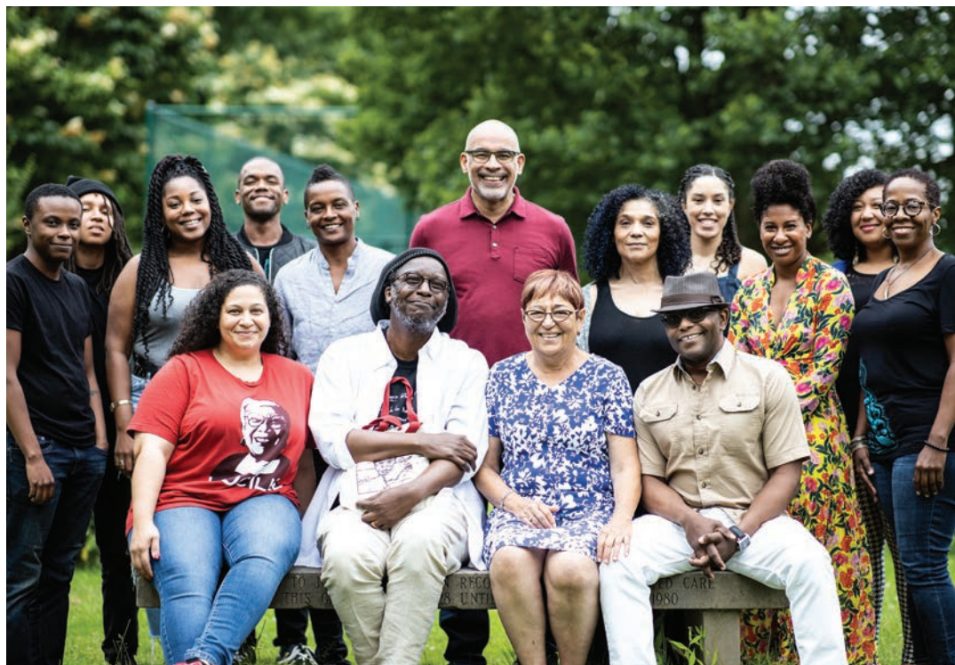
▼ The 2019 class of Cave Canem fellows.