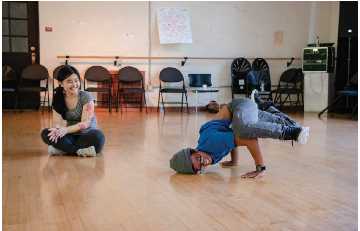
► Students participating in the 2018 Arts Liberation and Leadership Institute (ALLI).