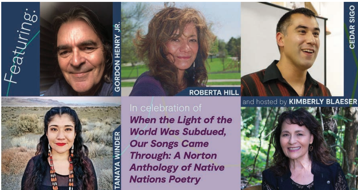
▲ In-Na-Po reading event held virtually and hosted by Woodland Pattern Book Center.

was like I was living in another era; it was another culture, and it was very alive with oral stories and word play.