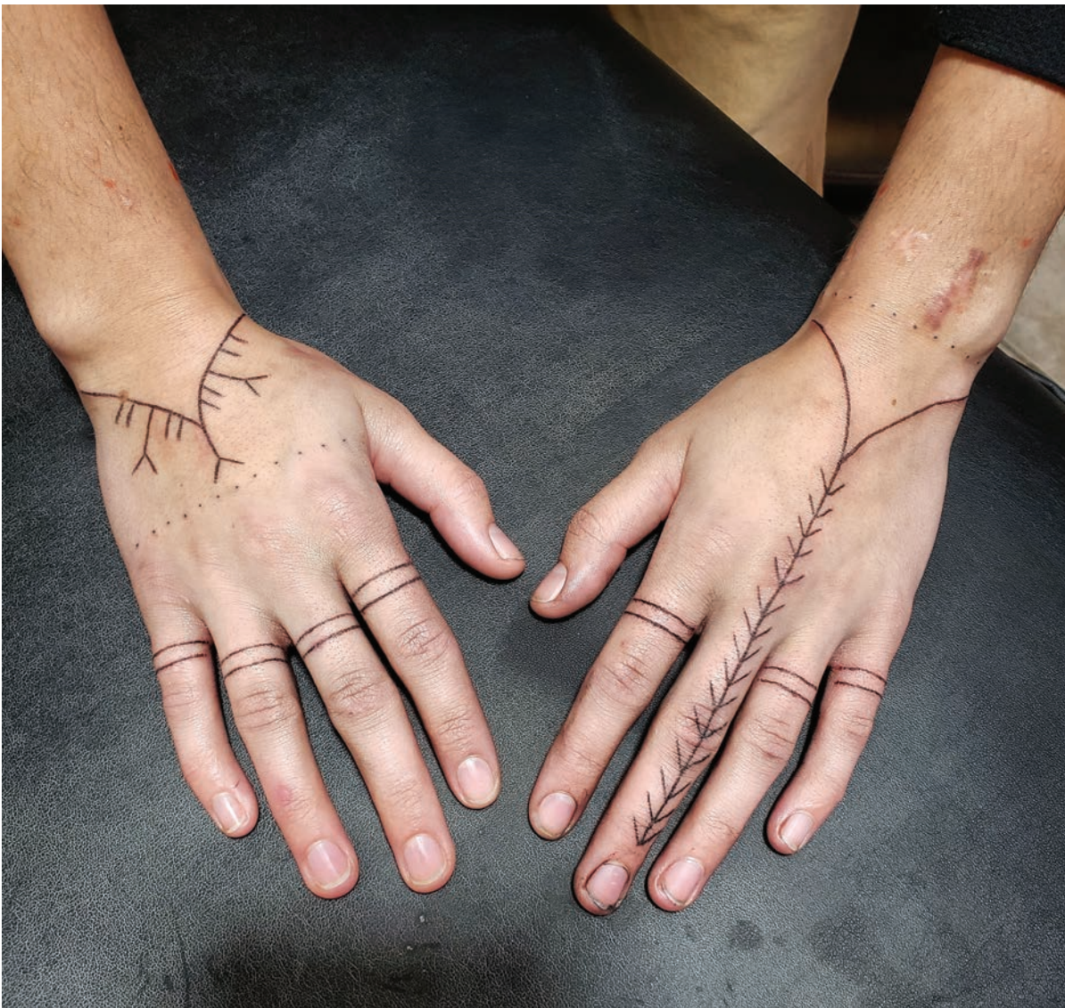
◀ Traditional Inuit tattooing.